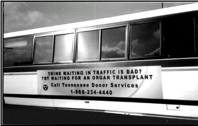
Bus sign that appeared on MTA buses.

The new name "National Donate Life Month" was chosen by organ procurement organizations and the Coalition on Donation. 2003 will also be the 20th anniversary of national recognition in the promotion of organ and tissue donation awareness. Tennessee Donor Services is planning a donor and recipient celebration on April 24 at 6:30 in the evening. Everyone is invited to attend. After the celebration we will be having a small reception, we hope that everyone will be there. If you would like more information or would like to make reservations please call the public education office at 615-234-5251 or toll free 1-888-234-4440.